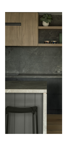
— Hermes Grey

Discover Vasari Surfaces—unmatched sophistication, designed to complement architectural expression and inspire the creation of spaces defined by thoughtful design.