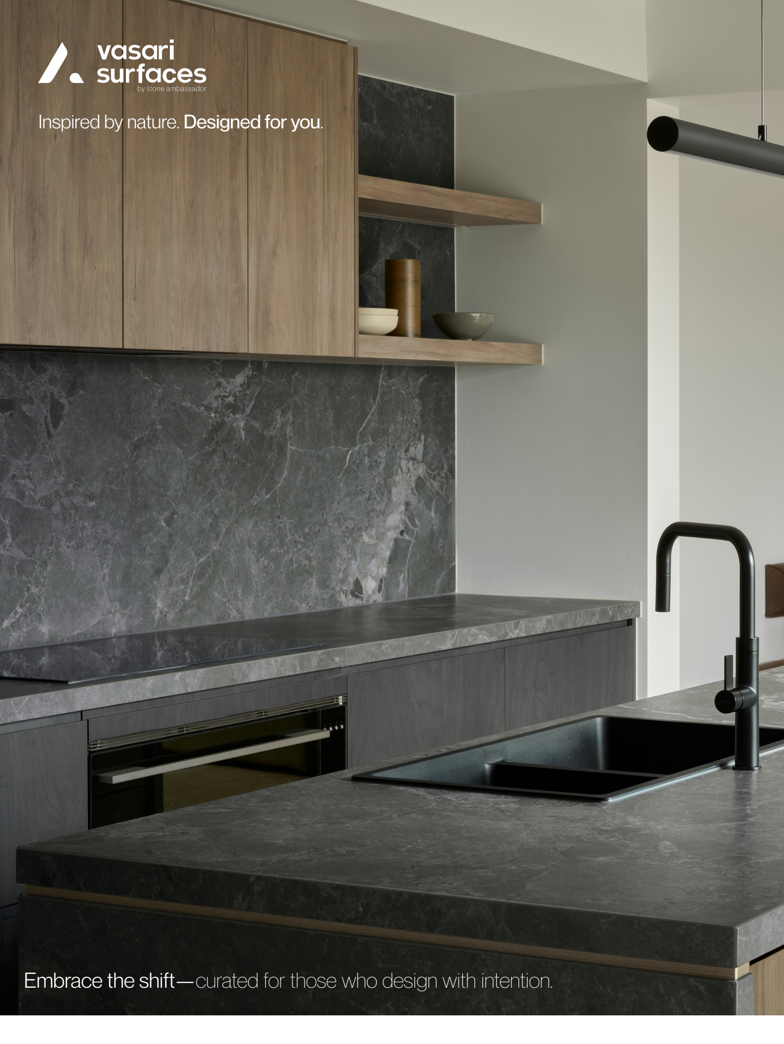
The Vasari Surfaces Price Group Drop