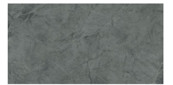
Atlantis Smoke M