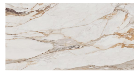
Р М В Grand Paradiso