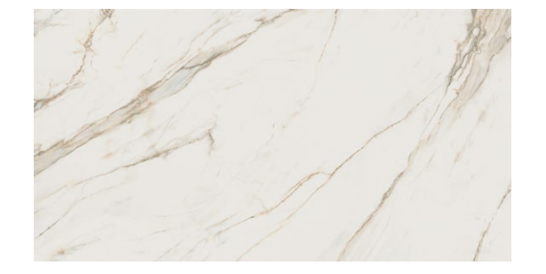
Aurora Gold Р М В