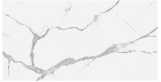
Versilia P M B