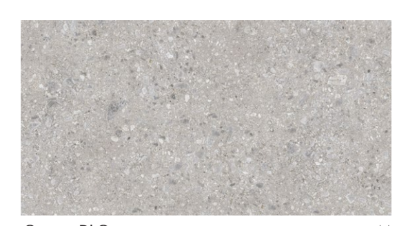
Ceppo Di Gre